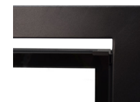
50MM TRIM powdercoat black