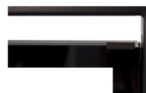
18MM TRIM powdercoat black *Includes Flance Kit For Flush Wall Finish